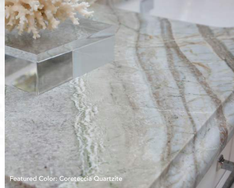
Featured Color: Coreteccia Quartzite